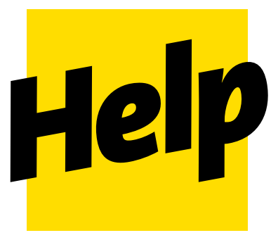
Hilfe zur Selbsthilfe e.V.